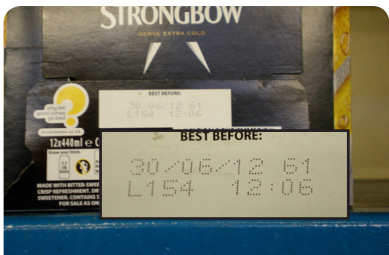
Continuous ink jet code on cardboard carton