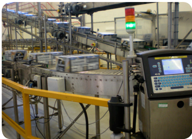
Videojet 1600 series printer online