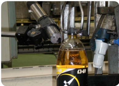
Strongbow Cider in PET bottle receiving Videojet code